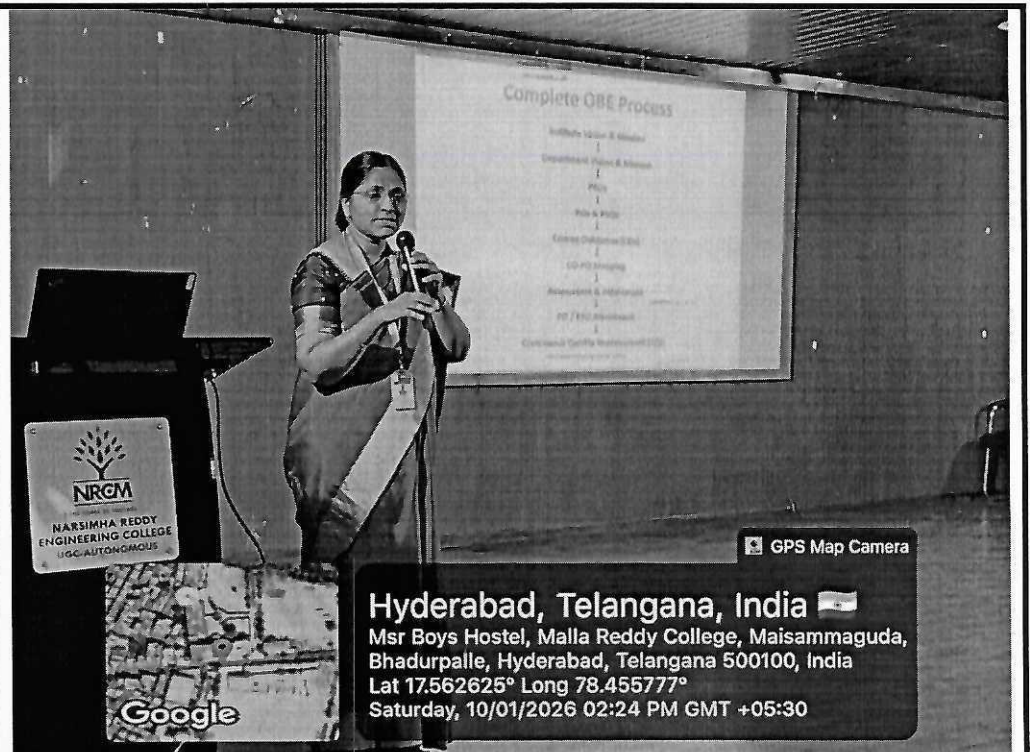
Event Photograph 2